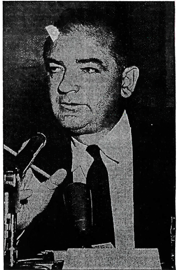
Senator Joseph McCarthy cross-examines a witness during the Senate hearings in the early 1950s.

when he claimed to have a list of 205 Communists in the State Department, President Harry Truman's 1947 executive order instituting a loyalty-security program for all federal civilian employees had already produced what the New York Times in 1951 called "a subtle, creeping paralysis of freedom of thought and speech" on university campuses. A mild manifestation of this phenomenon occurred